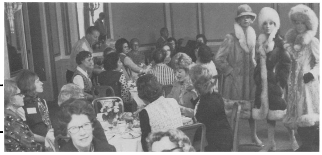
Participants in the program for AOCS spouses lunch in the presence of models sporting precious furs, part of a fashion show provided by the Hudson Bay Co.